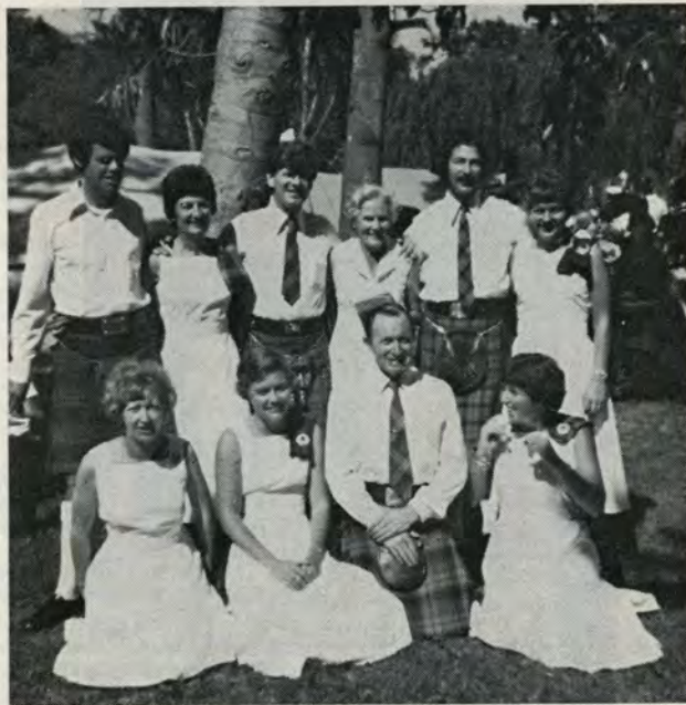
Cape Town's Senior Team: