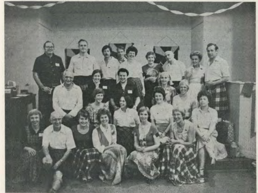
Houston Branch Members at First Anniversary Party.