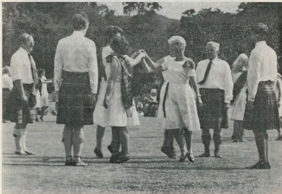
The Richmond Demonstration Team at the Leeds Festival, 1979

The Branch is always happy to welcome visitors to the Socials which are held on the first Friday of each month except August.