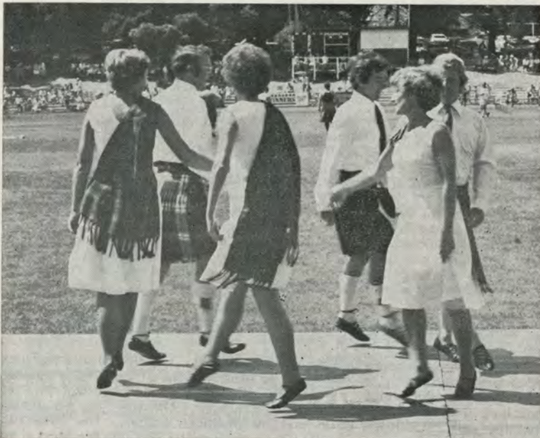
Mornington Peninsula Branch dancers at Frankston Highland Games February, 1980, dance "Salute to Miss Milligan".