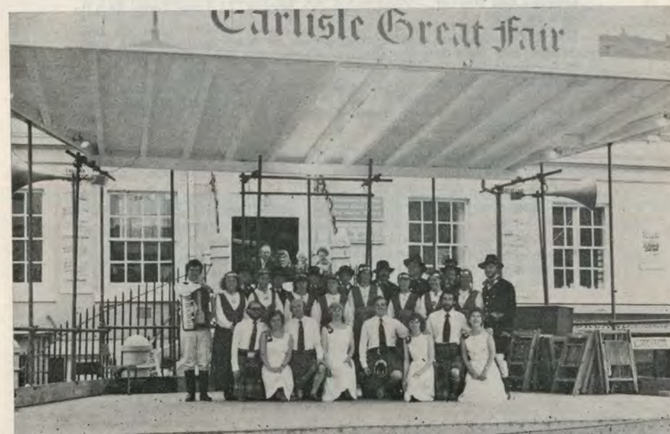
Carlisle and Border Branch at Carlisle Great Fair, August 1979, with Latvian Dancers.