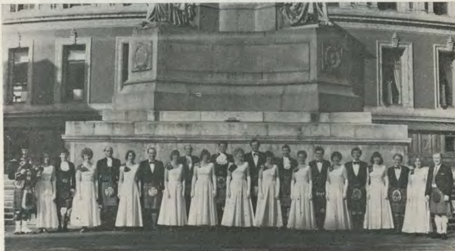
Members of London Branch at the Albert Hall, 1980.

Lorn (Argyll). Membership: 71 Annual, 8 Long Term, 42 Life. Classes per week: 1 Adult, 2 Children.