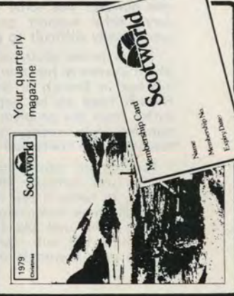
Your quarterly magazine