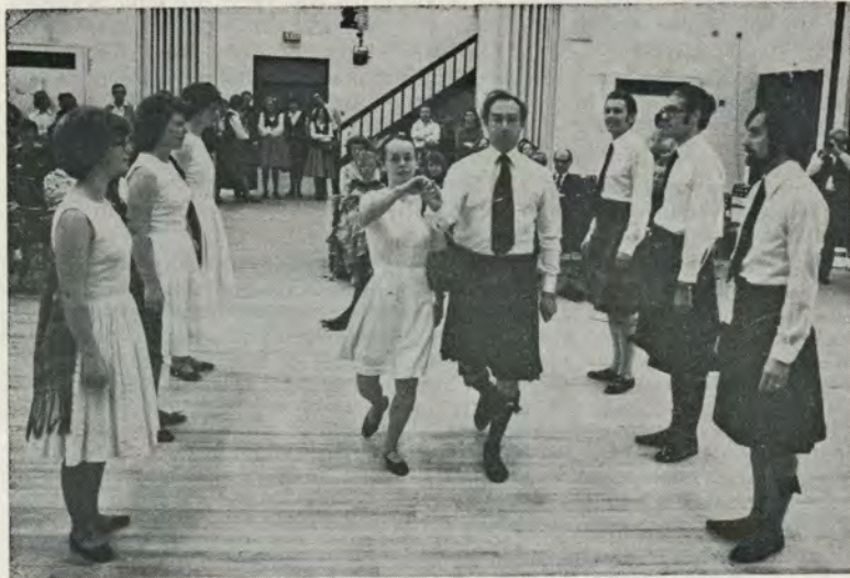
Milton Keynes Branch Day School

Newcastle-upon-Tyne and District. Membership: 310 Annual, 175 Long Term, 168 Life. Classes per week: 4 Adult, 1 Children. Demonstration Teams available.