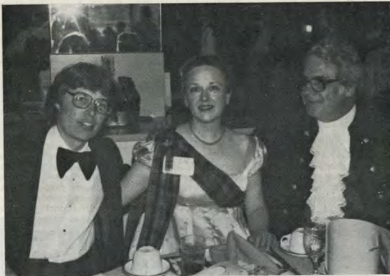
Pawling Committee, May 1980, at Holiday Hills. (18th Annual Weekend)

Northern Virginia. Membership: 115 Annual, 6 Life. Classes per week: 4 plus 1 fortnightly. Demonstration Team available.