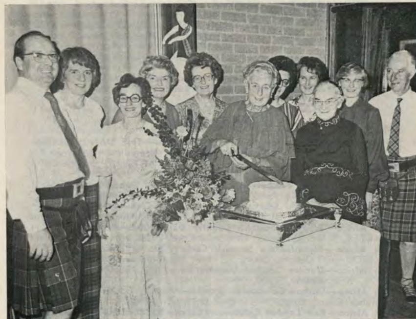
Downpatrick Scottish Country Dance Society Silver Jubilee Supper Dance, 8th November, 1977.