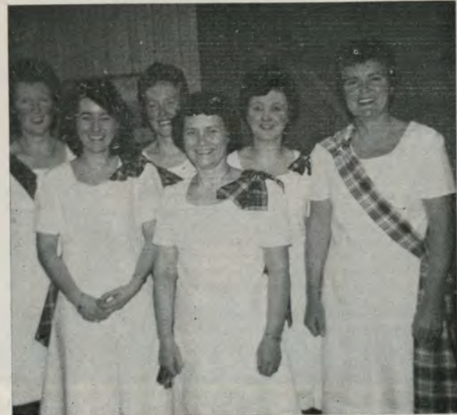
Stonehaven Branch Demonstration Team 1978

This has been a gratifyingly successful season and the Branch are convinced that the monthly socials, with the programme based on the dances taught at the classes, is the answer to maintaining numbers and interest. The main function of the season was the Non-Competitive Festival. This attracted over 800 dancers and over 1000 spectators. The non-competitive