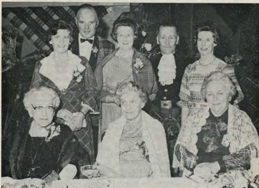
Duns and District Branch Anniversary Ball

A most successful children's class has been started with an overwhelming number of interested children attending.