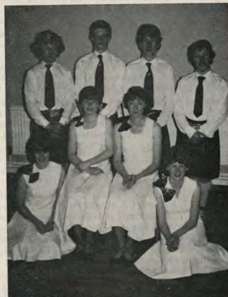
Belfast Branch Youth Team