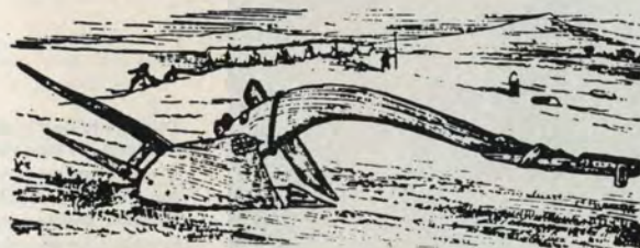
The "Twa Owsen Ploo"

SPECIALIST DEALERS IN ANTIQUARIAN SCOTTISH BOOKS