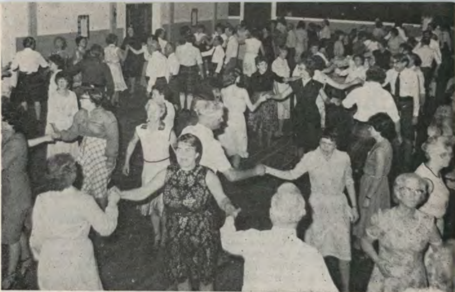
Carnoustie Annual Dance 1982

The Annual Dance was very successful, and the Border Reivers Scottish Country Dance Band, whom we had for the first time, played inspiring tunes. The Christmas Party was great fun, and the Junior Link Members were invited to join us, and it was a very happy occasion. The final Social was as popular as ever and went with a swing.