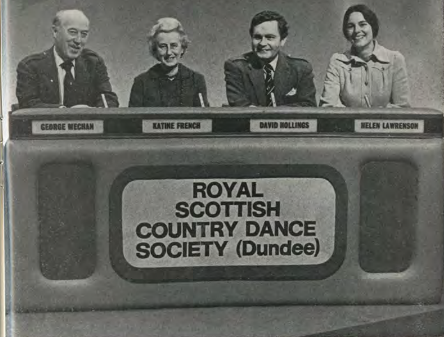
Dundee Branch "Top Club Quiz" Team

The two dances held during the year were most successful. The Branch look forward to even more activity in 1983-84.