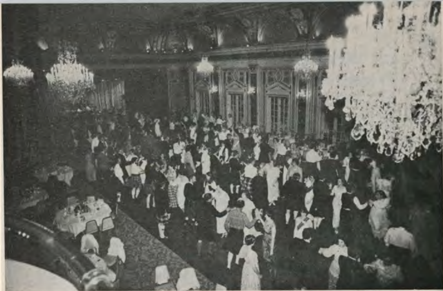
Boston Branch celebrates the Society's Diamond Jubilee with capacity attendance at their Highland Ball

Boston. Membership: 227 Annual, 2 Life. Classes per week: 5. Demonstration Team available.