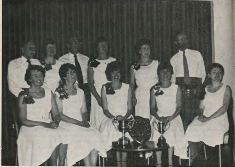
Leicester Branch Demonstration Dancers 1983