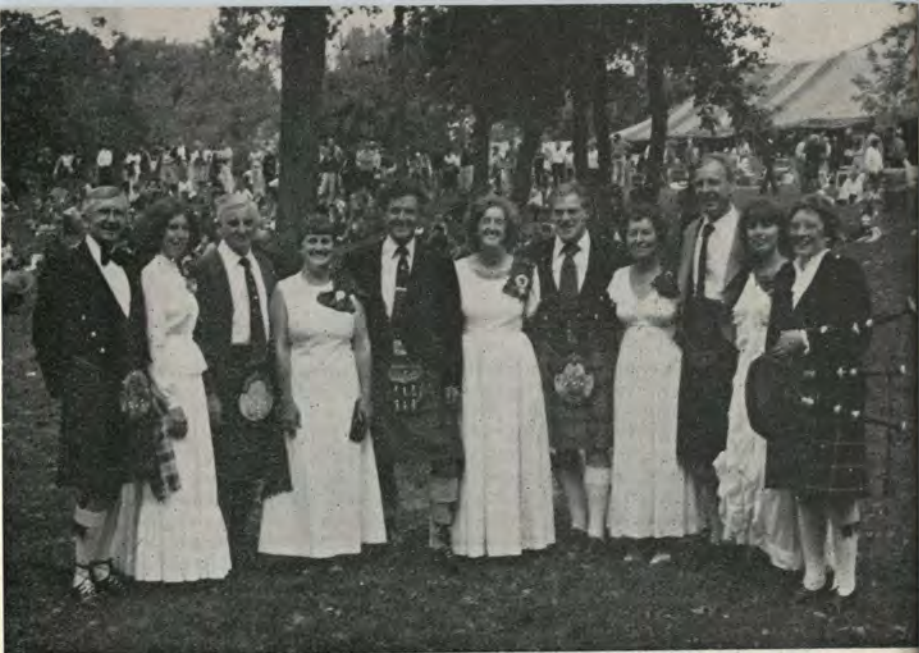
Detroit Branch Demonstration Team

Gothenburg. Membership: 45 Annual. Classes per week: 2. Demonstration Team available.