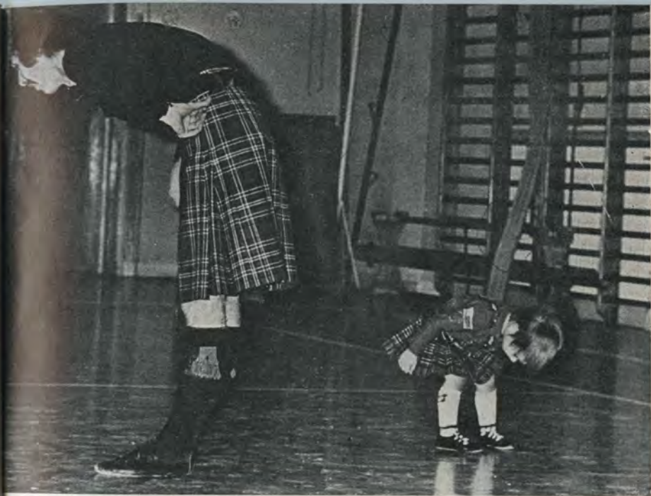
"Every dance should begin with a bow and curtesy—the natural 'honouring' of partner before the dance". (Won't You Join the Dance?).

Dunbartonshire West Branch approached the local schools to see if (a) they were interested and (b) could provide facilities during the