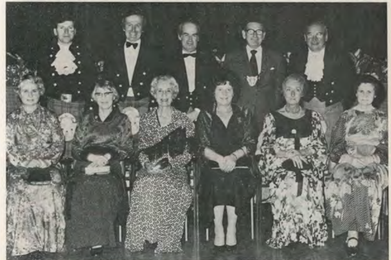
A happy group at East Stirlingshire Branch Golden Jubilee Ball