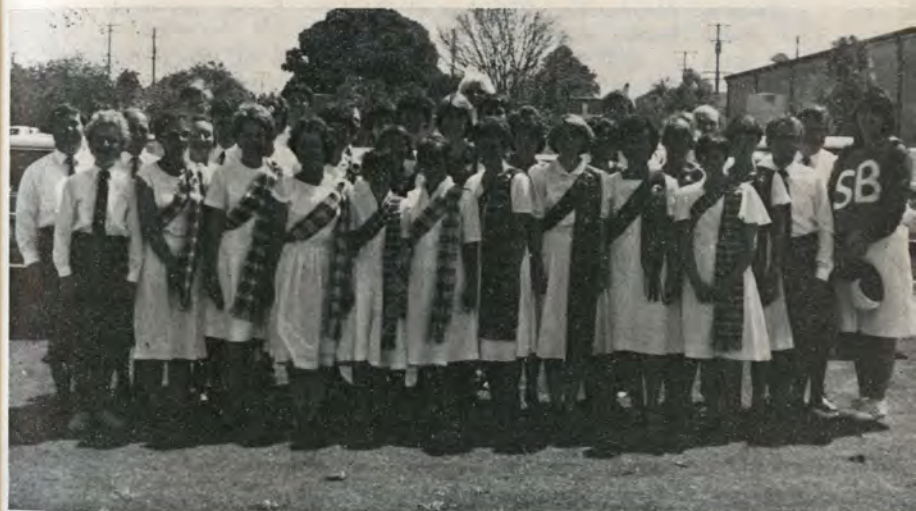
South East Queensland dancers who participated in the opening of the XII Commonwealth Games

Stockholm. Membership: 63 Annual, 1 Long Term, 1 Life. Classes per week: 1. Demonstration Team available.